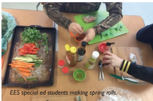
EES special ed students making spring rolls.