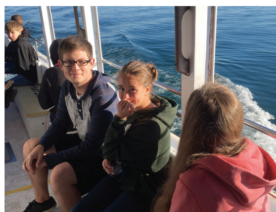
Students from Shead and EES travel to Treat Island for an archaeological dig.