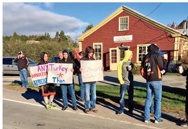
The Shead soccer teams attract attention to the 2016 Turkey-a-Thon.

Students raised about $4000 during the Eastport event, which is enough to purchase gift certificates for 333 turkeys.