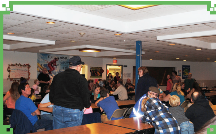
Members of the Shead/EES band perform for diners at the annual MELMAC parent/student/staff dinner in the EES cafeteria.