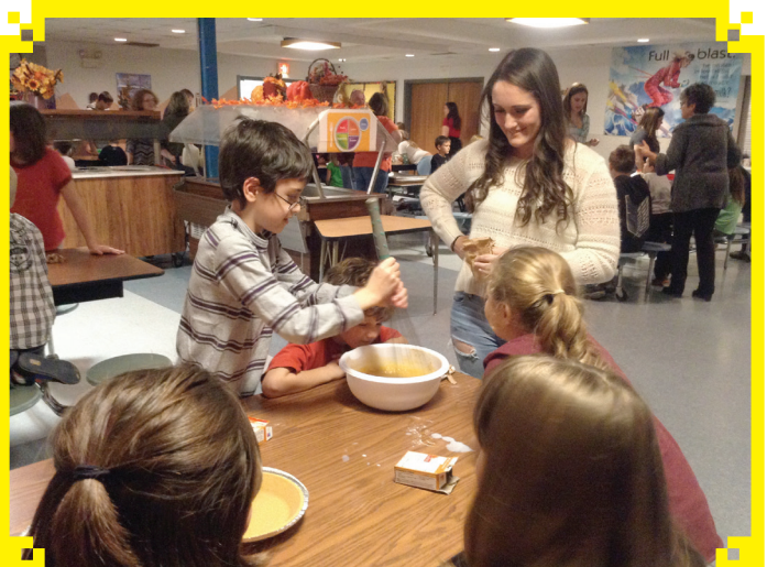
Pie-making for the annual student/staff Thanksgiving dinner.

The afternoon before the dinner, elementary school students assisted by members of the NHS made pies, including cranberry fluff, pumpkin, butterscotch, chocolate, banana, Oreo cookie, various cream pies, and a cheesecake.