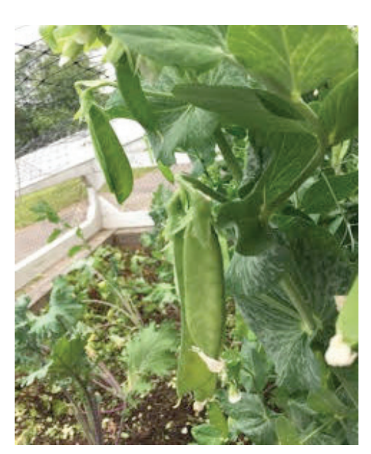
Peas in the EES garden!

The View From the Hill is published by the Eastport School Department with support from the MELMAC Education Foundation.